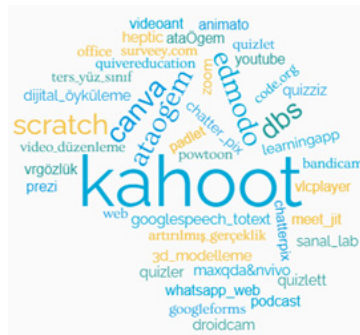
Figure 2: The word cloud of digital educational software used in the FTM process

"There is a lot that students (prospective teachers) do not know in this regard (use of technology). I want them to see very different examples of use." -Dr. Esra