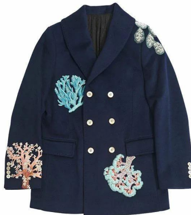
Figure 8. Embroidered jacket by Olga Glagoleva's go authentic brand, 2020 (URL: https://www.instagram.com/go_authentic/ )

2. Upcycling is reusing ready-made items or fabrics, converted items. For example, tracksuits from the Jahnkoy brand, complemented by decor, kimonos made from silk scarves from the Rianna + Nina brand, altered items from second-hand stores by the Vaquera brand, designer items mainly from old Maison Briz Vegas T-shirts (Binotto & Payne, 2019) embroidered old shirts, jackets and suits of the Russian brand go authentic (Fig. 8), famous bags from recycled fire hoses by Elvis & Kresse, Rachel Freire collections from factory remnants of leather. There are many examples – this is a very popular, even fashionable trend in clothing design now.