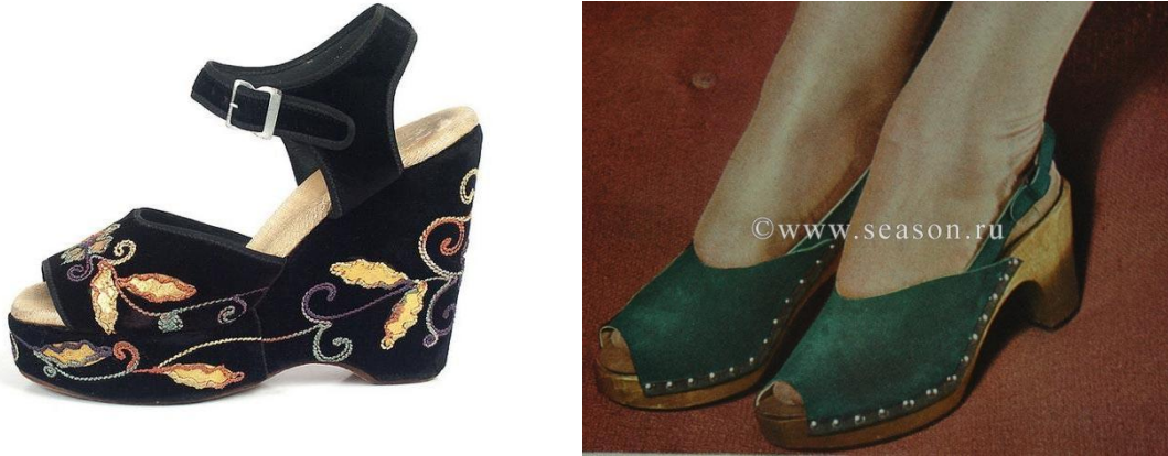
Figure 4. Hand-made shoes: a) fancy embroidered black velvet shoes with wooden wedges; b) suede shoes with wooden soles.

Shoe leather was also a strategically scarce material, so shoes were made from car tires, wood, cork, sewn from fabric, and knitted from threads (Fig. 4). Even the great shoemaker S. Ferragamo invented models with a knitted top made of threads with lurex, cellophane, etc. One tried to fix the worn-out shoes to extend their use.