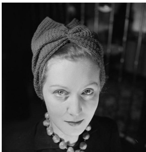
Figure 6. A head-wrap from a knitted tube. A model by the haute couture house Elsa Schiaparelli, 1941. Ph. Andre Zucca

One tried to compensate for the shortage of woollen clothing with knitting. One would knit jumpers, hats, scarves, jackets, vests, socks, gloves, and mittens (Fig. 6). In Great Britain, one even used dog wool and threads, which were sold for mending.