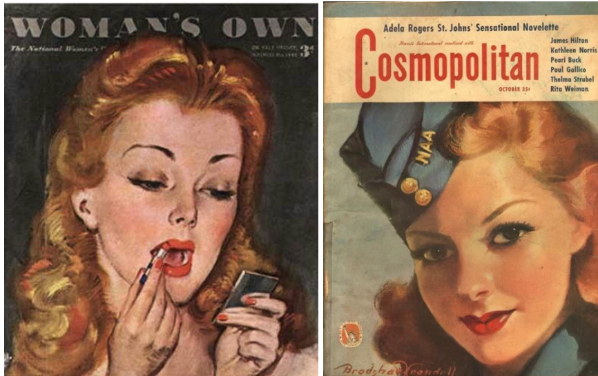
Figure 1. Covers of the British magazine "Woman's Own" and the American magazine "Cosmopolitan", 1942.

(URL: http://ivolgas.blogspot.com/2017/10/xx-1940_17.html )