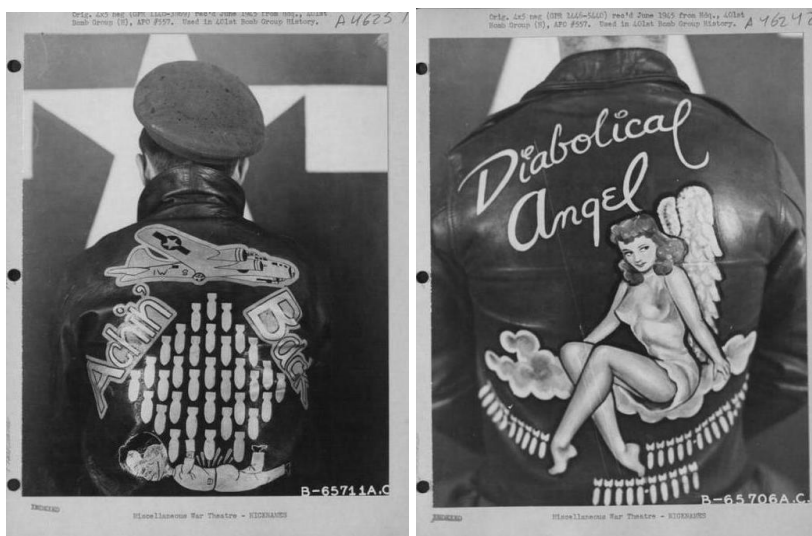
Figure 7. Painted pin-up jackets of American pilots.

painted their T-shirts with inscriptions, and the pilots decorated not only airplanes but also their jackets with images of naked beauties (Fig. 7).