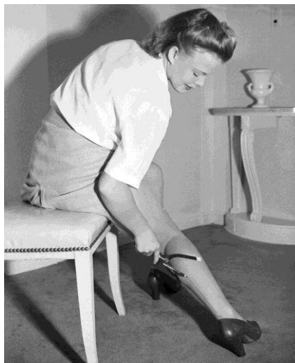
Figure 5. The woman shows a contraption for painting an even seam on the leg

The ban on the use of silk and nylon (in the United States since 1943) for civilian use led to the fact that thin stockings were the scarcest item. In the warm season, fashionable women wore short socks, as was already the case in the 1930s with sportswear. For the first time, official fashion allowed to wear shoes in the city on bare feet – before that, shoes on bare feet always indicated poverty. One would even imitate stockings, making up one's legs with wood stain or special paints produced by cosmetic companies (there is almost no mention of such a practice in the USSR and Germany). The seam on the drawn stockings was drawn with an eyebrow pencil (Fig. 5).