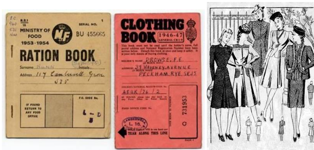
Figure 2. British books with clothing coupons; An illustration from the Soviet fashion magazine "Modeli sezona" [Patterns of the season], 1942

prices for clothing sold with coupons were fixed at pre-war levels (Cawtorne, 1996), in the USSR consumer demand was also constrained by high prices for clothing and footwear (Zhuravlev & Gronov, 2013). Researchers note that in the USSR, more than half of the clothes before the war were not factory-made, but home-made, especially in rural areas (Zhuravlev & Gronov, 2013). However, one should understand that this is not a specific feature of Soviet consumer practices. Home-made clothing is a part of the traditional way of life, which persisted for a long time in peasant families and the lower strata of the urban population (and wealthier people did not sew themselves, but bought made-to-order clothing from tailors, the social elite – purchased from high fashion houses); these consumer practices were widespread before the war. Everywhere, and not only in the USSR, girls were taught needlework, women knew how to sew, knit, and embroider, in contrast to many modern consumers who cannot even sew on a torn-off button. Many families had sewing machines. The author's grandmother took a hand-held sewing machine with her when she left Moscow for evacuation in September 1941, despite its heavy weight, and it helped her out. Therefore, the big problem for people of that time was not the need to make clothes on their own, but the shortage of fabrics, accessories, threads, and other supplies.